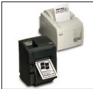
Gray & Putty