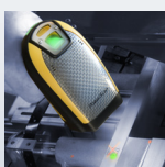
Hand Held scanners