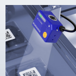
Stationary Industrial Scanners