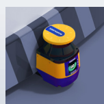
Safety Laser Scanner