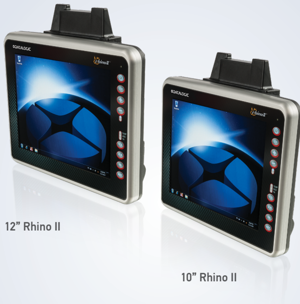
12" Rhino II