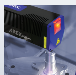
Laser Marking Systems