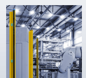
Safety Light Curtains