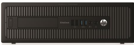
Small form factor